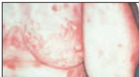
Figure 2. Pemphigus vulgaris. Disseminated, multiple, discrete, flaccid vesicles and bullae primarily on normal-appearing skin, erosions, and crusts.

External agents: The sun can induce a number of eruptions. If window glass prevents a sun-induced eruption, ultraviolet B must be the cause since ultraviolet angle can pass through window glass. A walk through brush a few days before itchy eruption onsets may suggest poison ivy contact dermatitis. Detergents and chemicals and “protective” gloves can induce an allergic or irritant contact dermatitis. Does the skin condi-