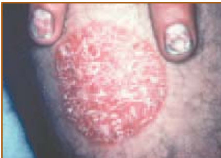
Figure 1. Psoriasis. Erythematous, circular plaque with dry, silvery-white scale and well-defined border. Note the associated nail changes.

Behaviour: Recurrence in the same location is typical for herpes simplex infections and fixed drug eruptions, which both typically last seven to 10 days.