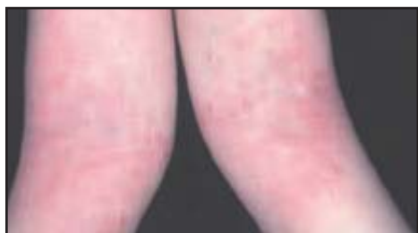
Figure 3. Atopic dermatitis. Adolescent with flexural (antecubital fossae) erythematous, poorly defined, scaly, lichenified plaques with excoriations.