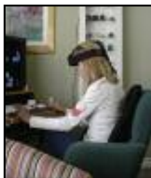
Figure 1: Patient receiving EEG-biofeedback neurotherapy treatment

Clinical trials are necessary to identify efficacy for treatment intervention; however, they do not accurately reflect real-world clinical practice. Choosing patients for