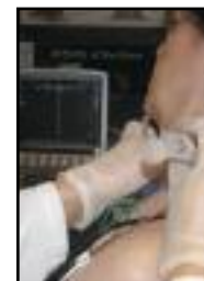
Figure 2: Ultrasound (Sonosite) guided Traumeel injection into scalene muscle