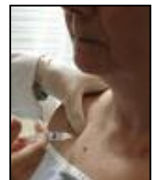
Figure 3: BTX-A injection into Pec minor muscle (Myoguide EMG guidance used in Cervical dystonia)