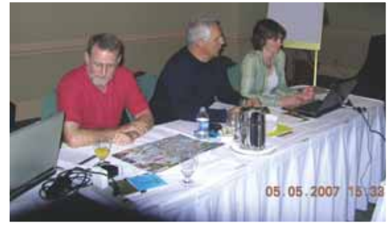
Woman at work. We have no idea what the men are doing!