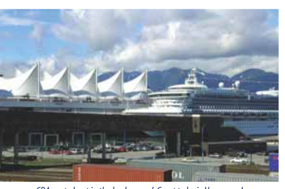
CRA party boat in the background. Great to be in Vancouver!