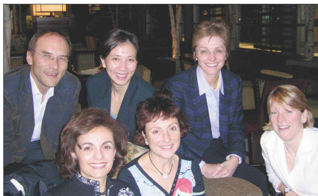
The Bomb Squad